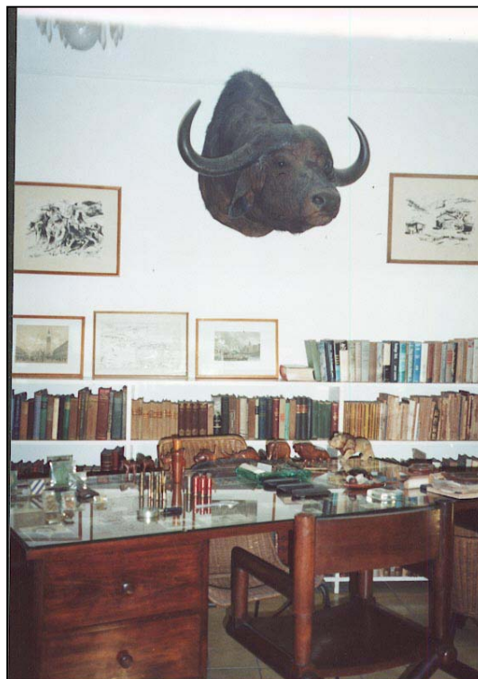
Books and desk at the Finca

Once this project is complete, the Kennedy Library will work with the Cuban curators in broadening access as much as possible by cataloging the materials and making the descriptions available at the Library. As part of the initial effort in cooperating with Cuba to obtain copies of Hemingway materials for our archives, Television Cubana gave the Library footage of Hemingway--previously unseen in the United States-- being interviewed in Cuba, in Spanish, shortly after receiving the Nobel Prize.