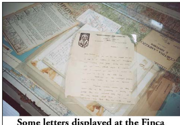
Some letters displayed at the Finca

Libraries and Archives and an advisory council composed of those who conceived the project and negotiated its early stages. Central partner institutions include the Hemingway Museum outside of Havana, the Center for Research Libraries in Chicago, the John F. Kennedy Library in Boston, the National Archives of Cuba and/or the José Martí National Library of Cuba, the National Council of Cuban Cultural Patrimony, and the Cuban Ministry of Culture. The Northeast Document Conservation Center (NEDCC) will help to carry out the preservation training and oversee the work at the Finca Vigia, Hemingway's former residence located on the outskirts of Havana.