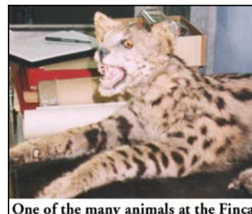
One of the many animals at the Finca

One Hemingway scholar permitted to see the documents has described them as "the last unexplored frontier of Hemingway studies." This trove of Hemingway documents includes 3,000 photographs, 2,000 letters and some draft fragments of his novels and stories, including a rejected epilogue--or the beginning of one-- to For Whom the Bell Tolls . There are also handwritten pages of earlier versions of the novel. The letters are from a host of famous literary and other figures of