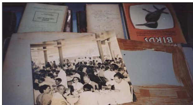
Books and photos at the Finca

Also of great interest is Hemingway's 9,000-book library, significant because Hemingway often wrote his thoughts and even composed letters in the margins of his books. Scholars have long suspected that important material could be found there, and their suspicions have now been confirmed. Some books also contain inscriptions from authors such as Ezra Pound and Martha Gellhorn, and one book contains a very sarcastic reply to Gellhorn, which Hemingway apparently never sent.