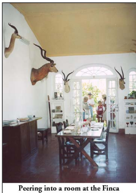
Peering into a room at the Finca

The materials currently housed in the Hemingway Museum at the Finca Vigia constitute a large and important collection until now inaccessible to American and other scholars, and are in a critical state of deterioration. The collection contains, among other materials, Hemingway manuscripts, correspondence, scrapbooks, ephemera and a substantial collection of books, many with marginalia by Hemingway. At present, these materials have been removed from public access in an attempt to slow their deterioration, underscoring the urgency of the initiative to restore, preserve, and conserve the materials. Only in so doing can we ensure access to this vital resource for scholars in the US, Cuba, and around the world, as well as for the greater public.