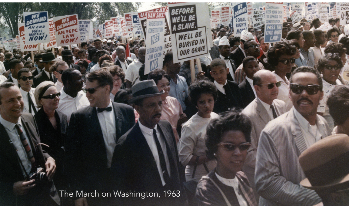
The March on Washington, 1963

For more information about our collections and research services, please visit: jfklibrary.org/archives